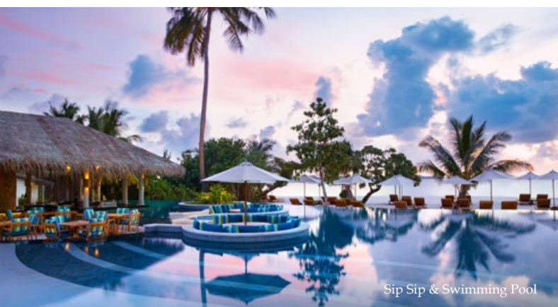
Sip Sip & Swimming Pool

Six Senses Spa offers nine private treatment nests, either with an ocean view or tucked away in the lush nature that surrounds them. Awaken the senses with locally inspired and Ayurvedic treatments, massages, yoga and fitness classes or workshops. Highly skilled Six Senses Spa therapists use a synergy of natural products to provide a comprehensive range of award-winning signature procedures and journeys, plus rejuvenation and wellness specialties of the region. Visiting practitioners offer guests lifestyle consultations and using the results of a non-invasive health screening, our experts crafts a specialized holistic wellness program for each individual.