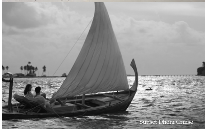
Sunset Dhoni Cruise