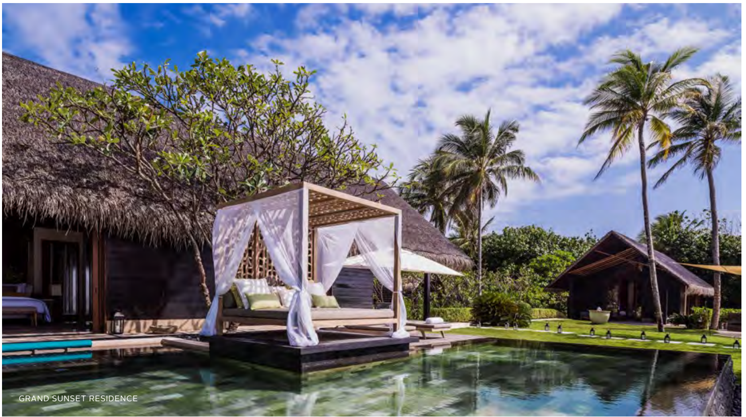
GRAND SUNSET RESIDENCE