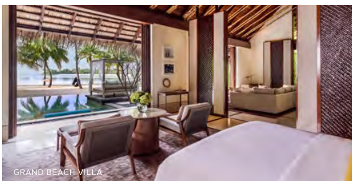
GRAND BEACH VILLA