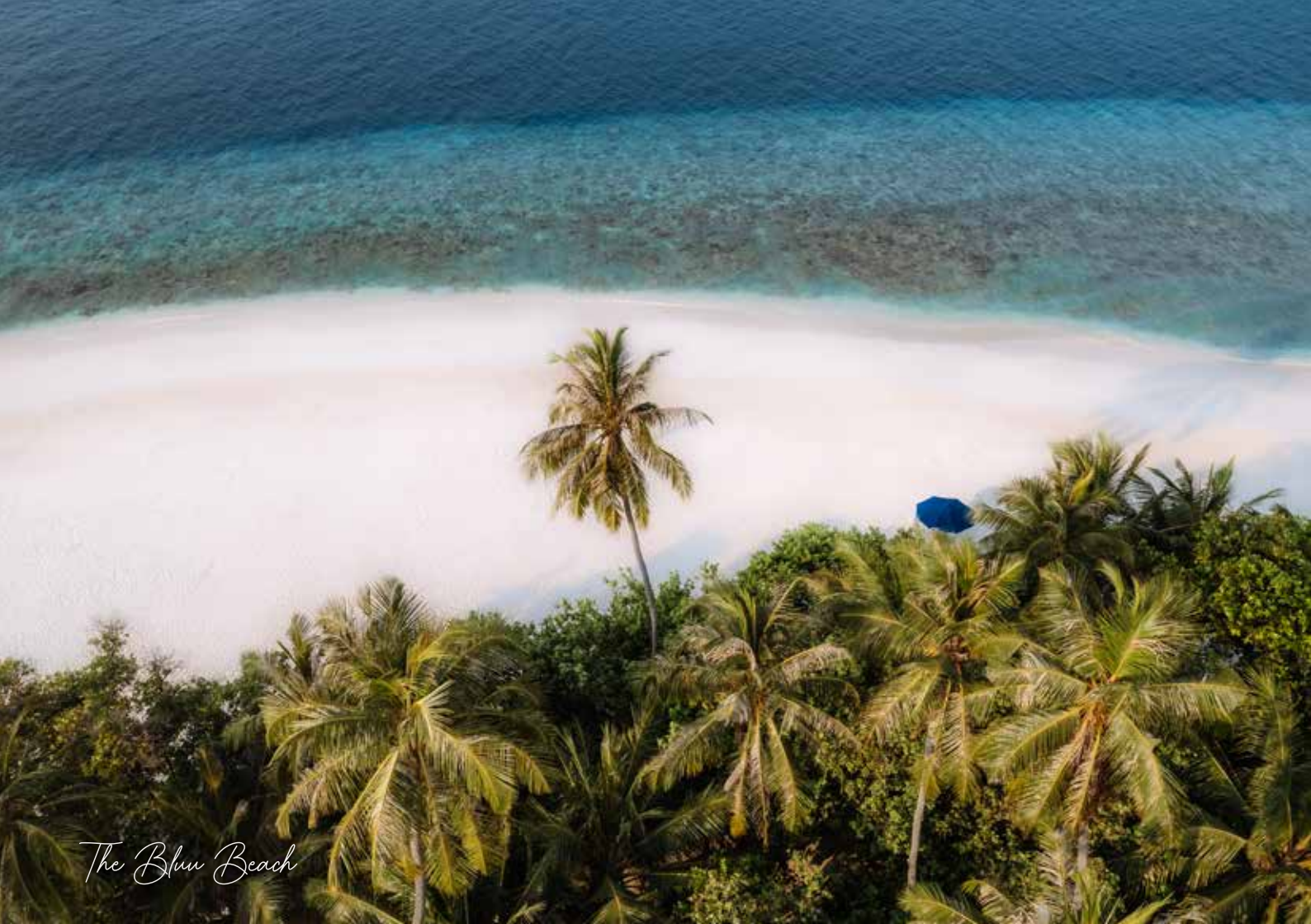
The Blue Beach

Wandering re-establishes the original harmony which once existed between man and the universe