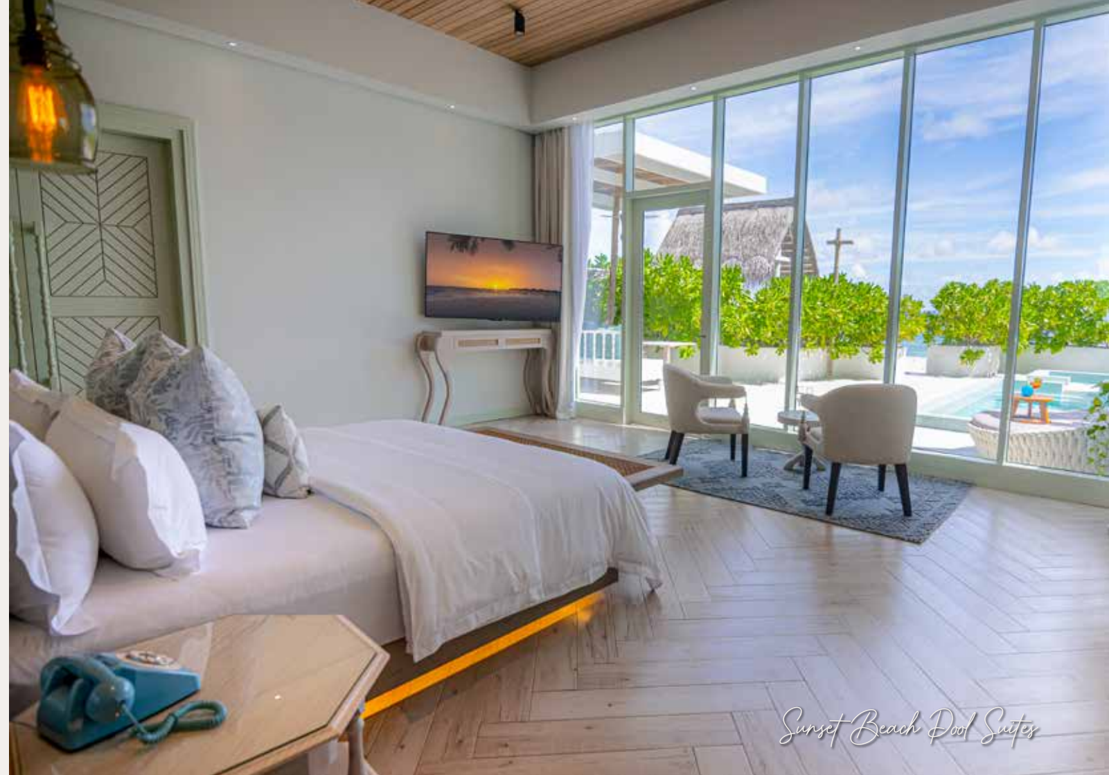
Sunset Beach Pool Suites

ultimate blend of culture and tradition, washed with soothing greys and gentle celadon complimented by the surrounding flora.