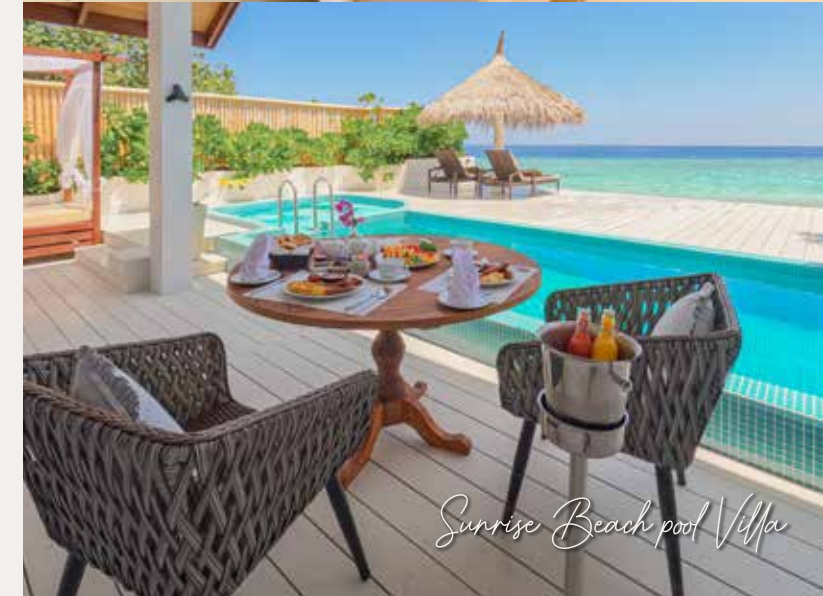
Sunrise Beach pool Villa