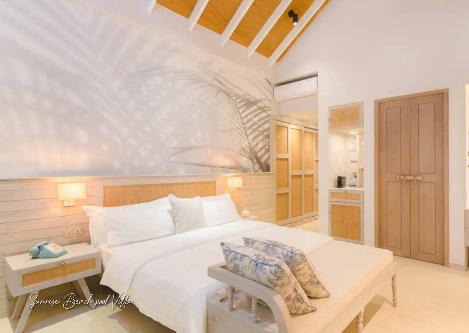
Sunrise Beach pool Villa