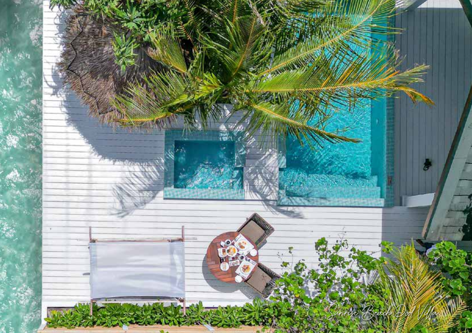
Sunrise Beach Pool Villa