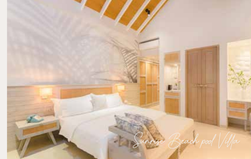
Sunrise Beach pool Villa

Our luxurious, contemporary and tropical Sunrise Beach Pool Villas offers the perfect sanctuary fusing indoor outdoor living seamlessly. The floor to ceiling windows frame views of the beach, expansive outdoor seating area, sun-deck, a private pool and hot tub. The Villas are designed to be aesthetically pleasing while giving a feeling of calmness