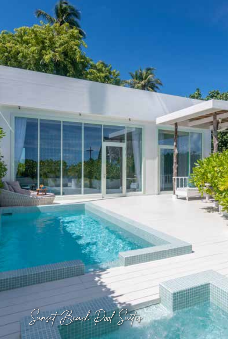
Sunset Beach Pool Suites