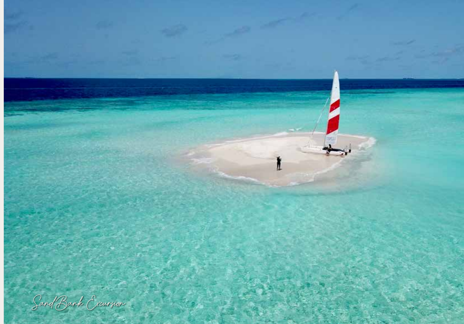
Sand Bank Excursion

Enjoy a wide variety of games and activities around the island, from Beach volleyball, Pool, Foosball, Air Hockey to Dart, theres always an exciting experience around every corner.