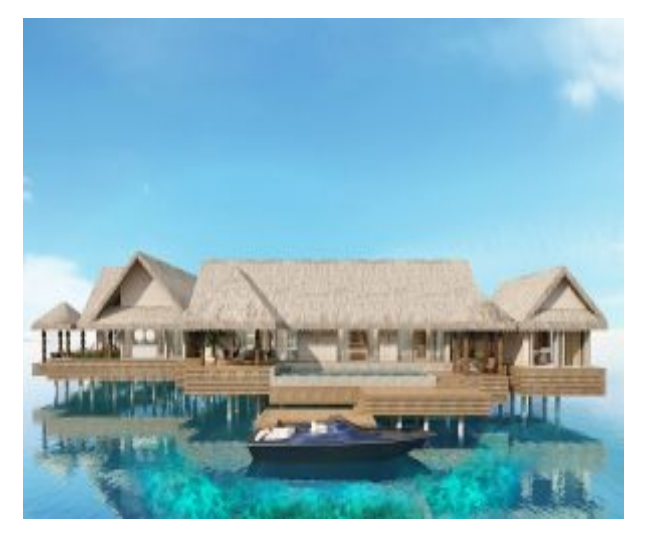
Private Ocean Residence