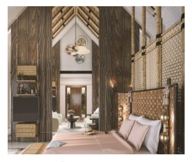
Luxury Water Villa