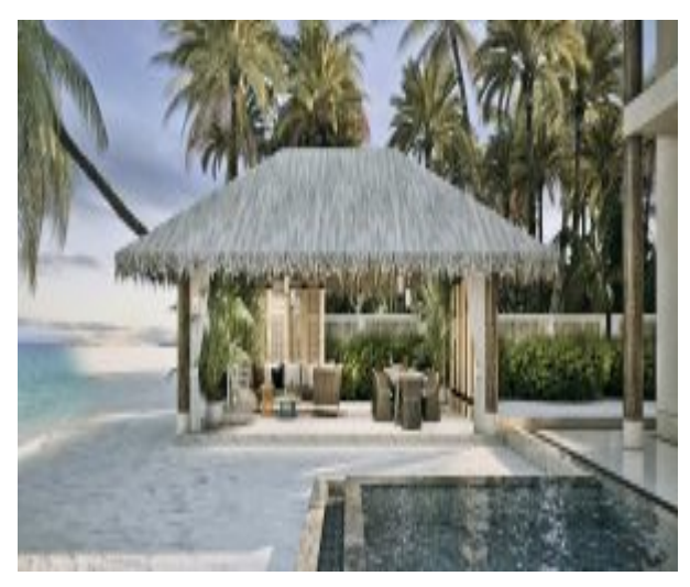
Private Duplex Beach Residence