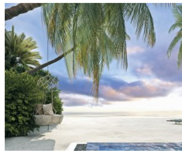
Luxury Beach Villa