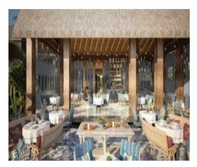
The Italian Restaurant