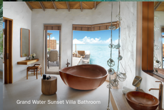
Grand Water Sunset Villa Bathroom