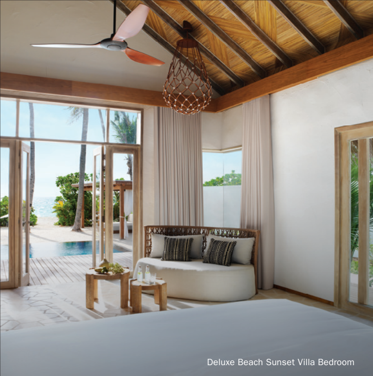
Deluxe Beach Sunset Villa Bedroom