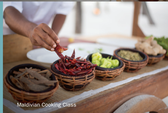
Maldivian Cooking Class