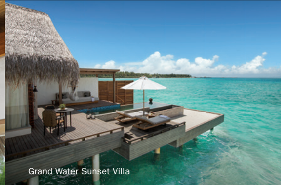
Grand Water Sunset Villa

The beaches sparkle a shade of white you've never seen before; the turquoise waters of the Indian Ocean glimmer in the tropical sun; the wind blows gently through mangrove and jungle. Welcome to Sirru Fen Fushi, or "Secret Water Island," the most exclusive island in all of the Maldives' 26 atolls. It's all yours to explore at Fairmont Maldives, Sirru Fen Fushi, where our sophisticated beach, over-water and jungle villas immerse you in comfort, romance and island charm. The sights and sounds of nature greet you each morning; the bounty of the ocean awaits at night. And all day long, the vibrant spirit of the Maldives shines through every inch of the island, showing you a life you always dreamed was possible.