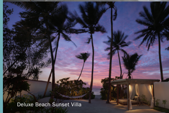
Deluxe Beach Sunset Villa