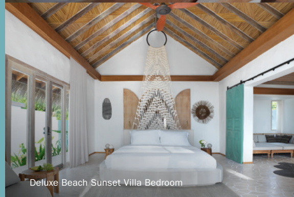
Deluxe Beach Sunset Villa Bedroom