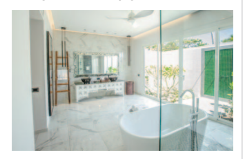
Beach Villas (176sqm) Total 14 Units