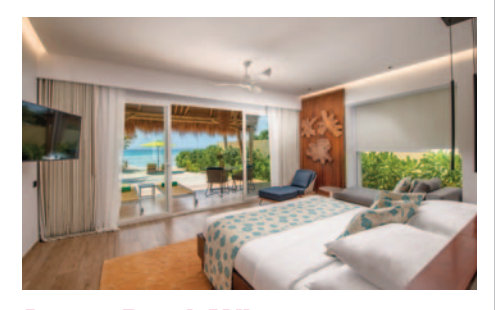
Jacuzzi Beach Villas (176sqm) Total 4 Units - Jacuzzi 2x2m