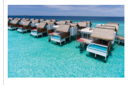
Superior Water Villas with Pool (310sqm)