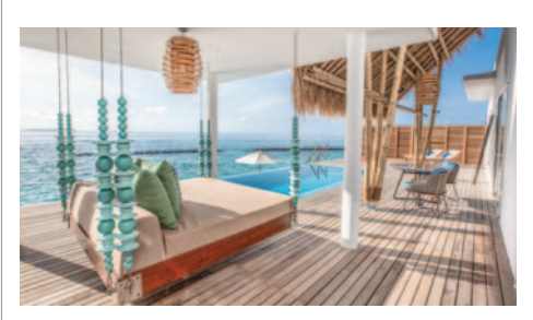
Presidential Water Villa (640sqm) Total 1 Unit - Pool 10x4m