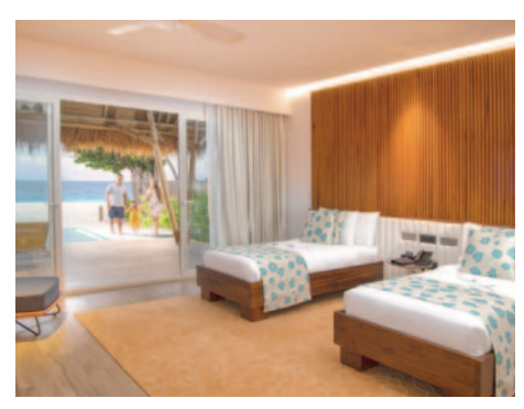
Superior Beach Villas with Pool (280sqm)

Total 20 Units - Pool 8x3m - two bathrooms