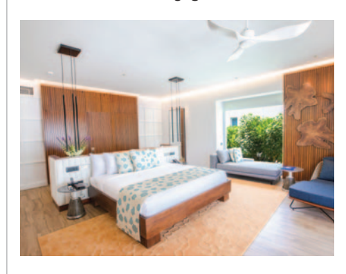
Family Beach Villas with Pool (280sqm)

Total 20 Units - Pool 8x3m - two bathrooms