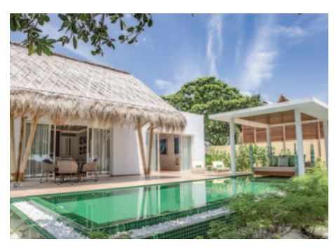
Royal Beach Villa (900sqm) Total 1 Unit - Pool 8x3m - two floors